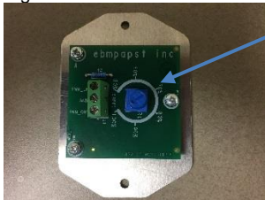
EBM Max CFM Adjustment Board

Rotate dial clockwise to increase max airflow or counter clockwise to decrease. (Used with 0-10VDC fan speed signal)